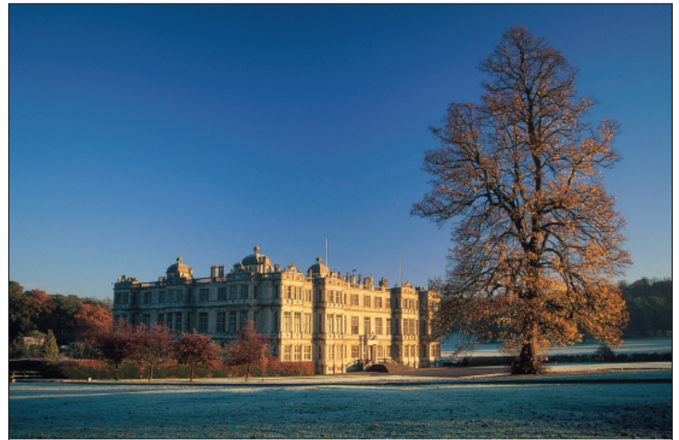
Longleat in autumn