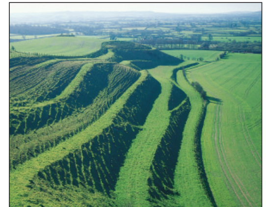
Strip lynchets at Mere Down