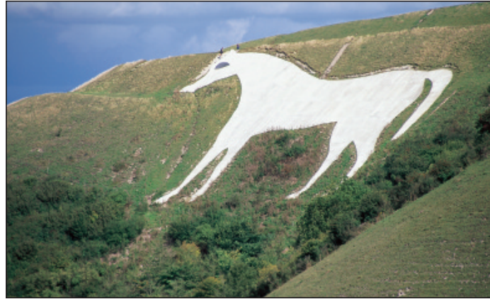
The Westbury White Horse