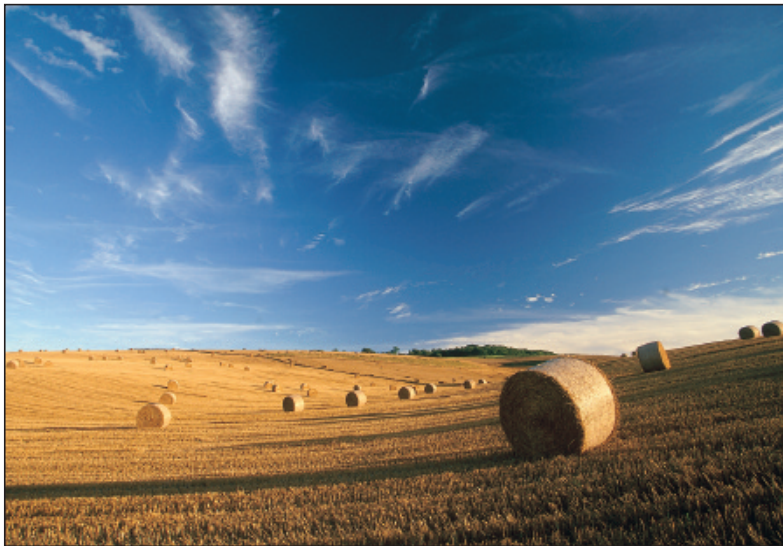
After the harvest