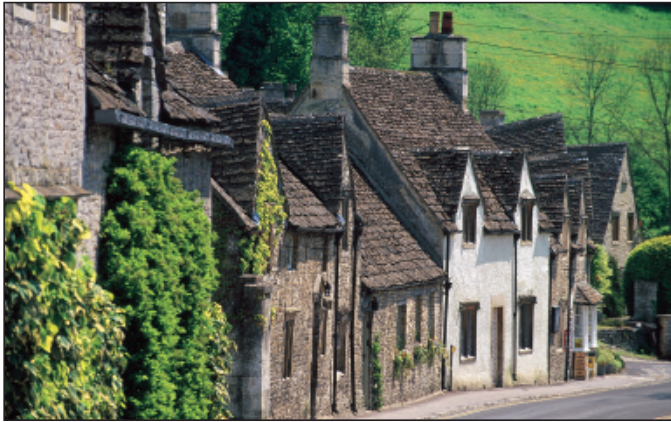
Harmony at Castle Combe